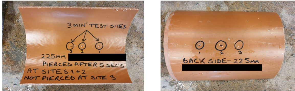
Figure 6. Sample 6 after testing.

PVC pipe with smooth external & internal surface was tested. All three jetting sites tested pierced the inner surface after approximately 5 seconds and two out of the three sites pieced the full wall depth of the product a few seconds after.