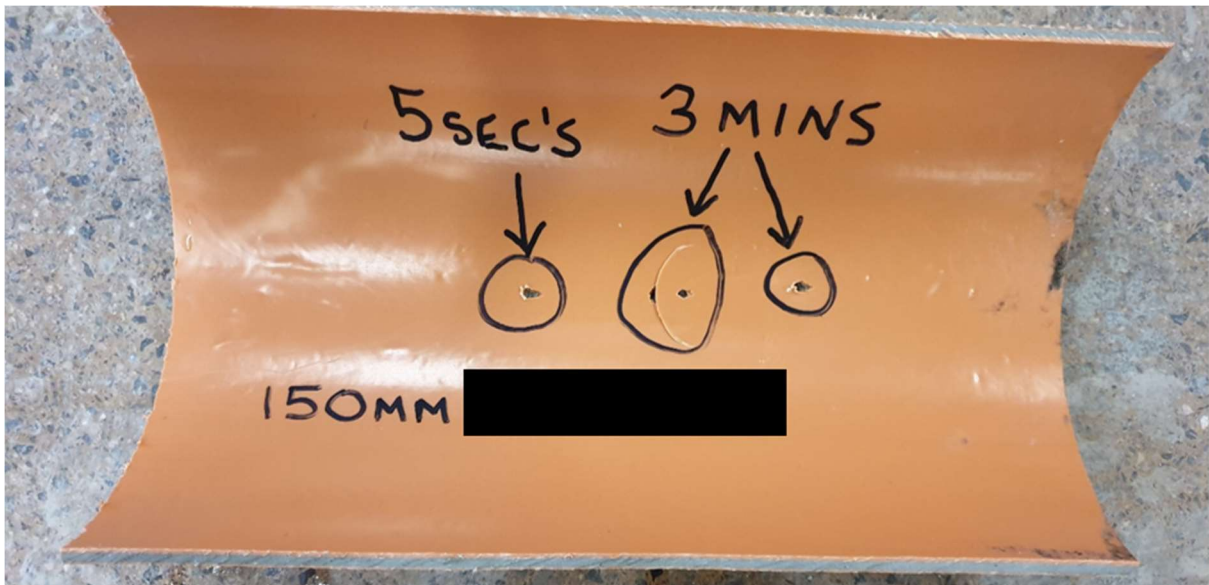
Figure 3. Sample 3 after testing.

the full wall depth of the pipe after three minutes of test duration. Blister size approximately 50mm in diameter.