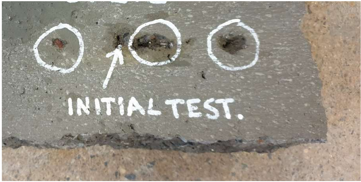
Figure 1. Sample 1 after testing.