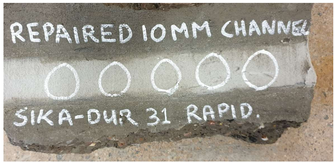
Figure 2. Sample 2 after testing.

A BPDA member company DN 450 concrete pipe with a repaired 10mm deep x 10mm wide channel<sup>1</sup> was tested. No visible damage was caused by the water jet at any of the jetting sites tested.