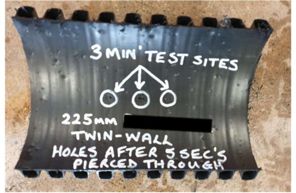
Figure 5. Sample 5 after testing.

One double-wall type DN225 pipe was tested. All three jetting sites tested pierced the full wall depth of the product after approximately 5 seconds.