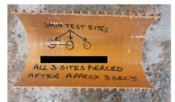
Figure 7. Sample 7 after testing.

uPVC type DN150 plastic pipe was tested. All three sites tested pierced the inner surface after approximately three seconds and continued to pierce the full wall thickness after several more seconds under the test.