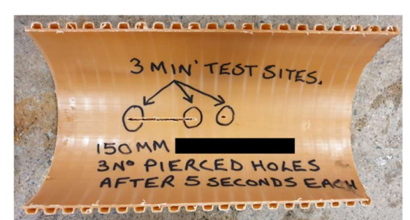
Figure 4. Sample 4 after testing.

One Double-wall type DN150 plastic pipe was tested. All three jetting test sites pierced the inner surface after 5 seconds and quickly continued to pierce through the full wall depth.